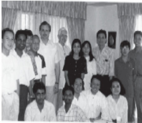
Asia Seminary of Christian Ministries, Manilla