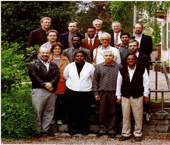
World Alliance of Reformed Churches- Pentecostal Dialogue started May 1996, hosted by Waldensians in Italy